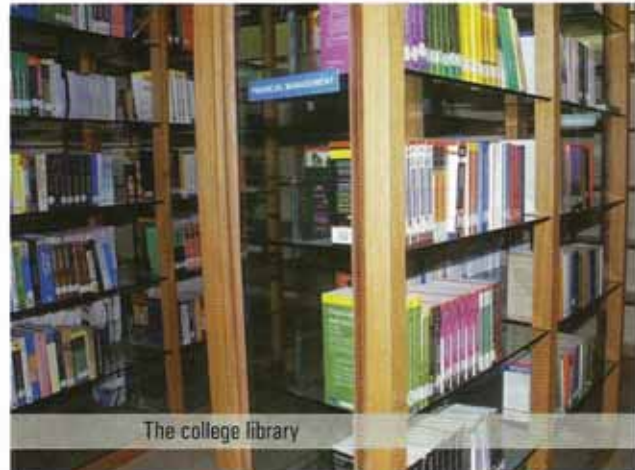
The college library

The institute encourages its students to take up social responsibilities and causes. The second year students of