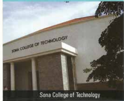
Sona College of Technology