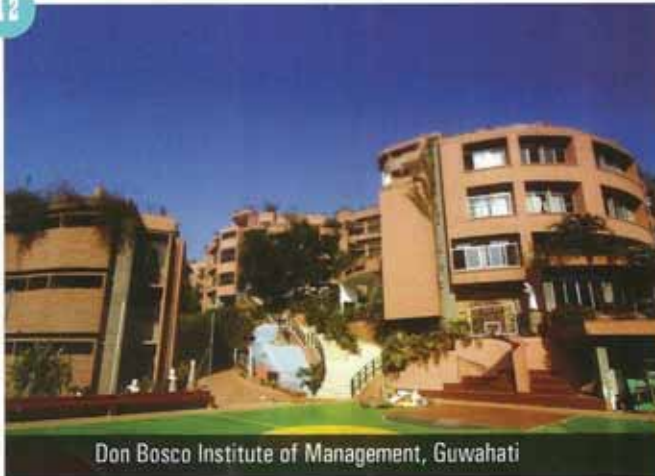
Don Bosco Institute of Management, Guwahati